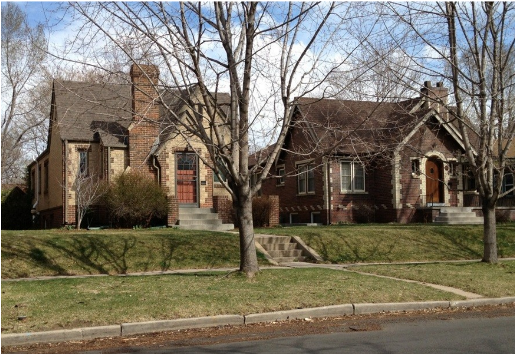
Figure 4. Streetscape of single-family homes built in the 1920s and 1930s, located on the 2000 block of Kearney Street in Park Hill. These houses are located five blocks north of the house in Figure 3.