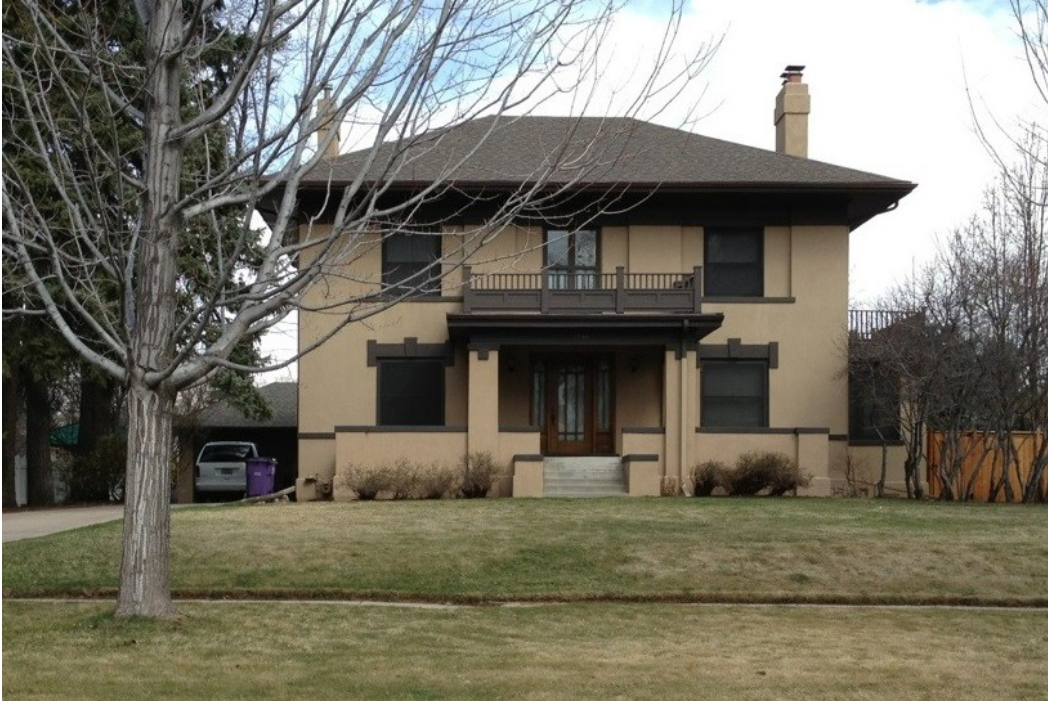
Figure 3. A single-family home on the 1500 block of Kearney Street in southernmost Park Hill.