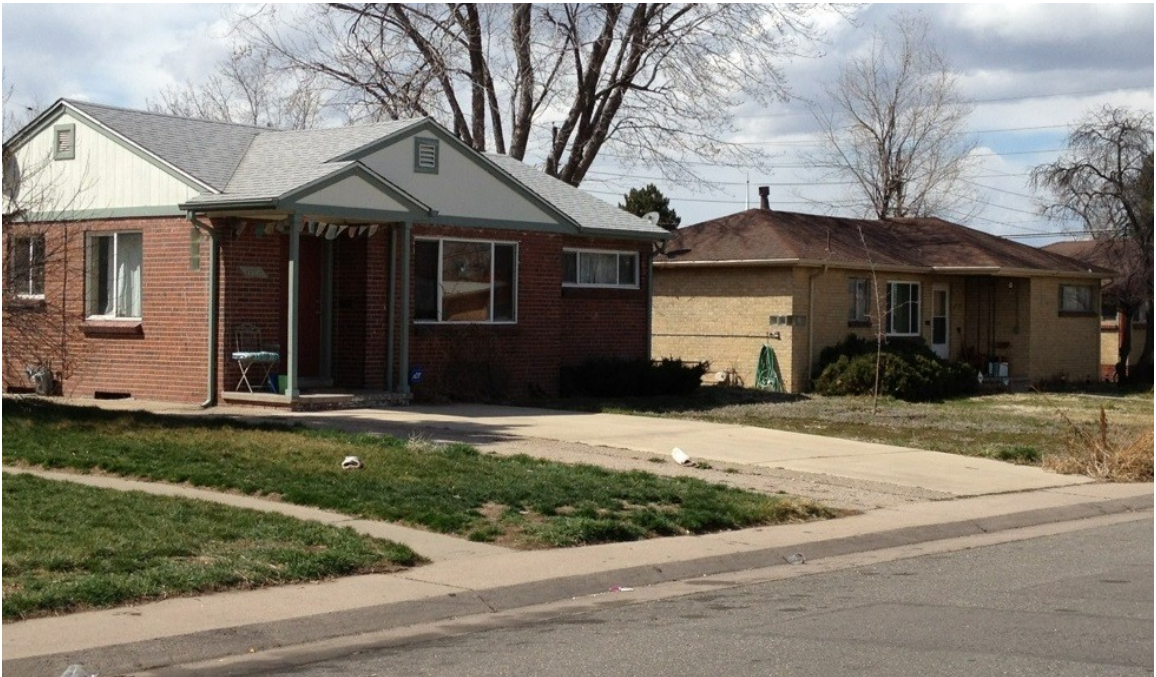
Figure 6. Streetscape of post-World War II single-family homes on the 3500 block of Glencoe Street in northeastern Park Hill. These houses are located ten blocks north of the houses in Figure 5.