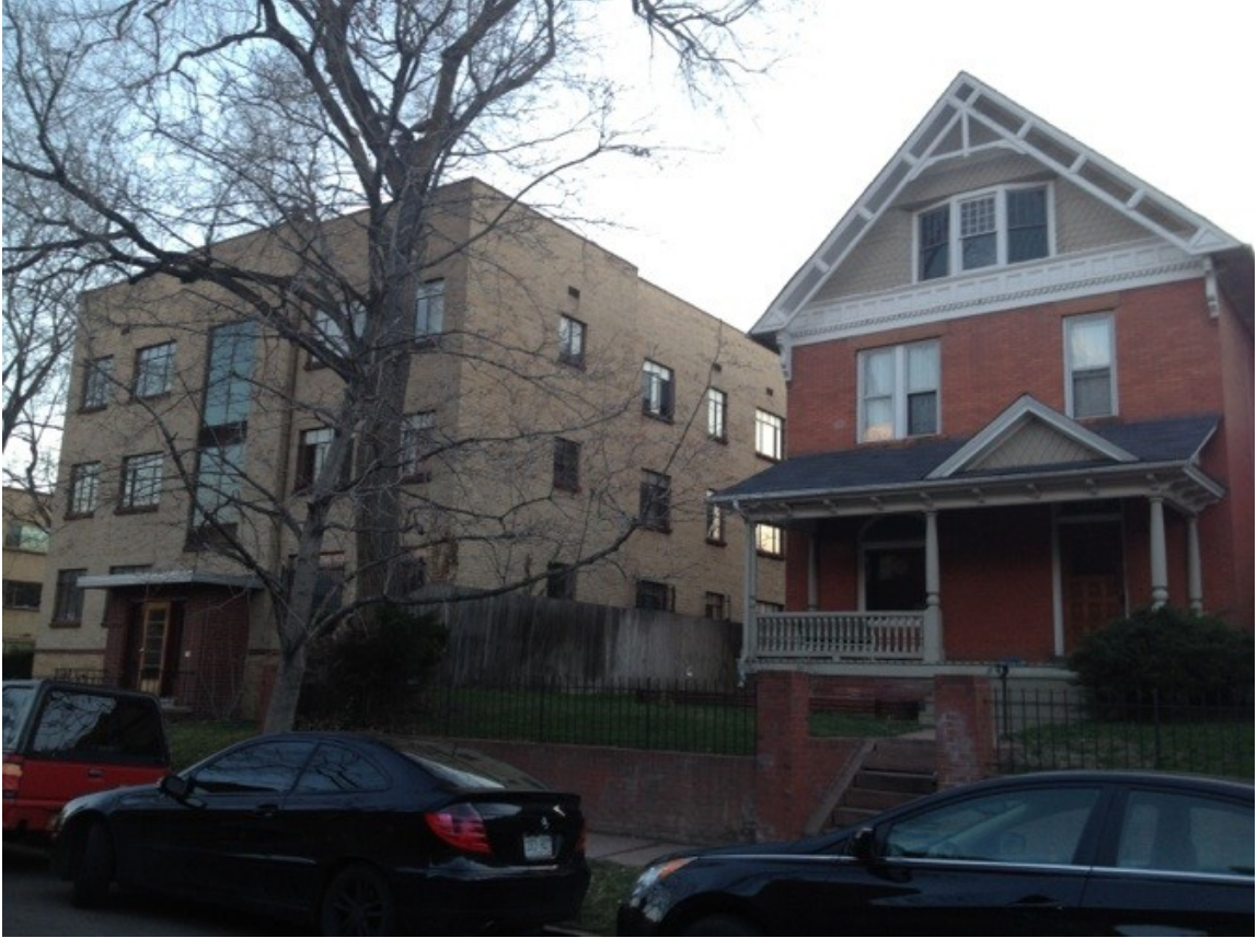
Figure 7. Streetscape of multi-family housing on the 1200 block of Emerson Street in Capitol Hill. The building to the left is an apartment building constructed in the late 1940s, and the building on the right is a single-family home from the 1890s that was later converted into apartments.