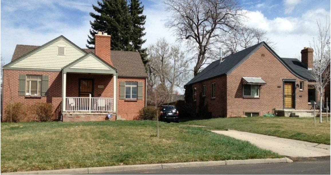
Figure 5. Streetscape of single-family homes built in the 1930s and 1940s on the 2500 block of Kearney Street in northern Park Hill. These houses are located five blocks north of the houses in Figure 4.